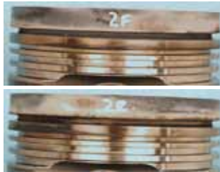
Minimal piston deposits after a proprietary 500-hour endurance test of Cat DEO-ULS.

Cat® DEO-ULS™ delivers excellent valve train protection.